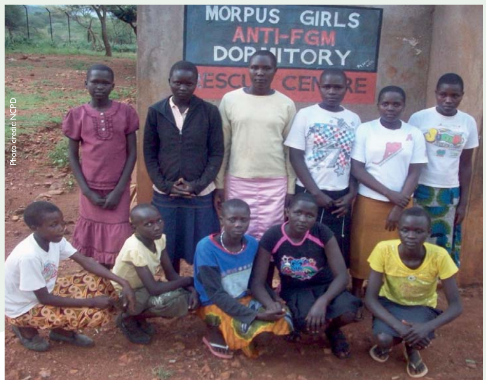
Girls who ran away to escape FGC pictured at their new home - Morpus Rescue Centre