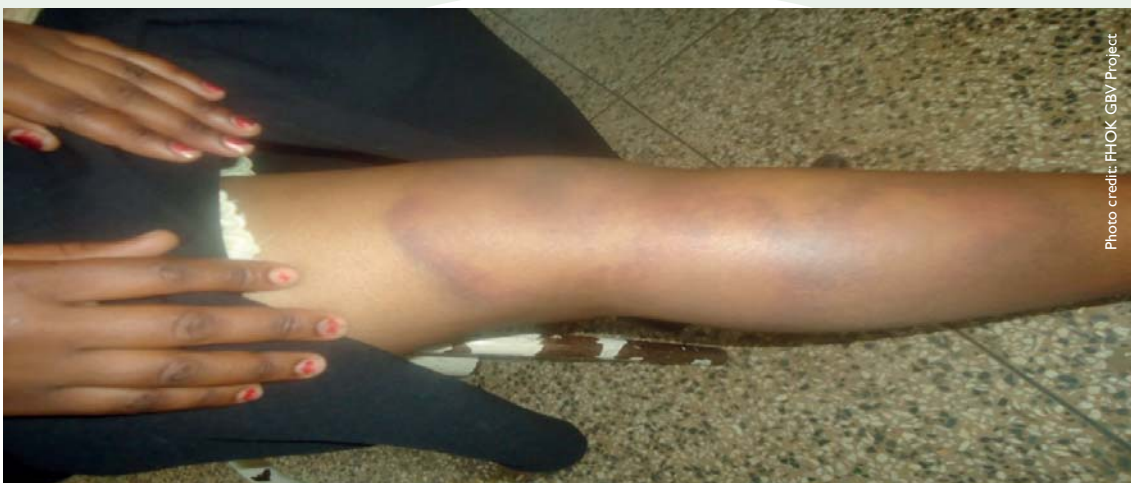
Female survivor of GBV

Women are also largely at risk of FGM/C, the prevalence rate in Kenya being 27 percent 6 FGM/C involves partial or total removal of external female genitalia or injury of female organs for cultural or other non-therapeutic reasons. About 93 percent of those circumcised are children below 18 years old. In North Eastern, 64 percent of circumcised women underwent the procedure between ages 3 to 7 years, while in the Coast, the highest proportion of circumcision is performed during infancy. 7 This happens despite recognition that FGM/C is a violation of children's rights and a harmful practice that poses great risk to the health and well being of women and girls who undergo it.